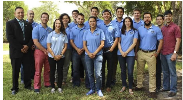
DOE Fellows participated in summer 2015 student internships