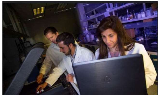
DOE Fellows and mentor conducting research in the ARC Radiological Laboratory