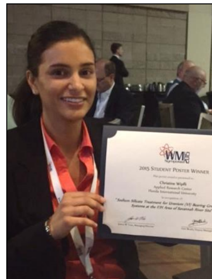
DOE Fellow (Winner of Best Student Poster) at WM15